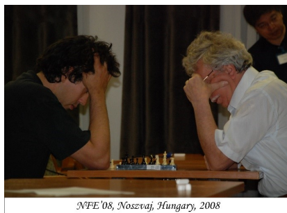
NFE '08, Noszvaj, Hungary, 2008