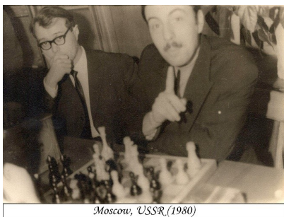
Moscow, USSR (1980)