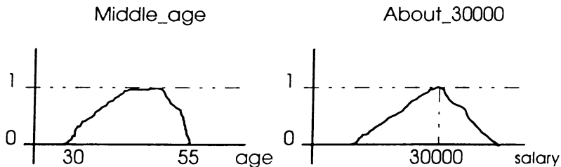
Figure 2.1. Values in a relation expressed by fuzzy sets

Here the age and salary columns have fuzzy sets as their values, they can be given by the following functions: